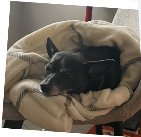
Yockey submitted by Kaori Nakama