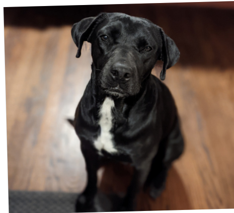
Luce submitted by Therese Grande