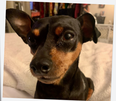
Sophie Sugaree submitted by Liz Caluag