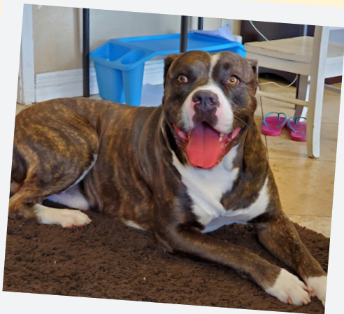
Chopper submitted by Ben Olague